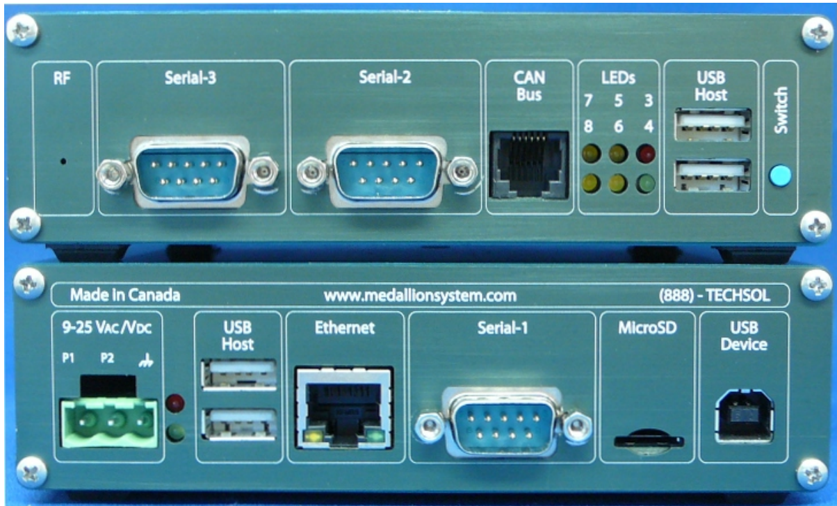
2010-09-29 - Techsol's Gateway Express 2 Communications Computer .