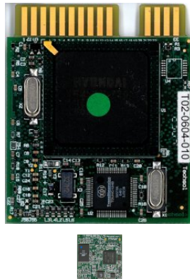
2009-09-30 - Techsol Celebrates a Decade of ARM Designs .