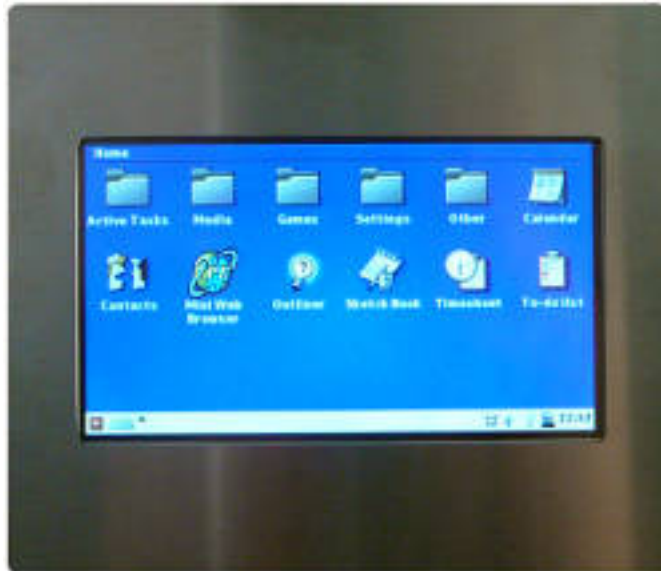
2008-02-13 - Techsol's TPC-43A Medallion Touch-Panel Computer .