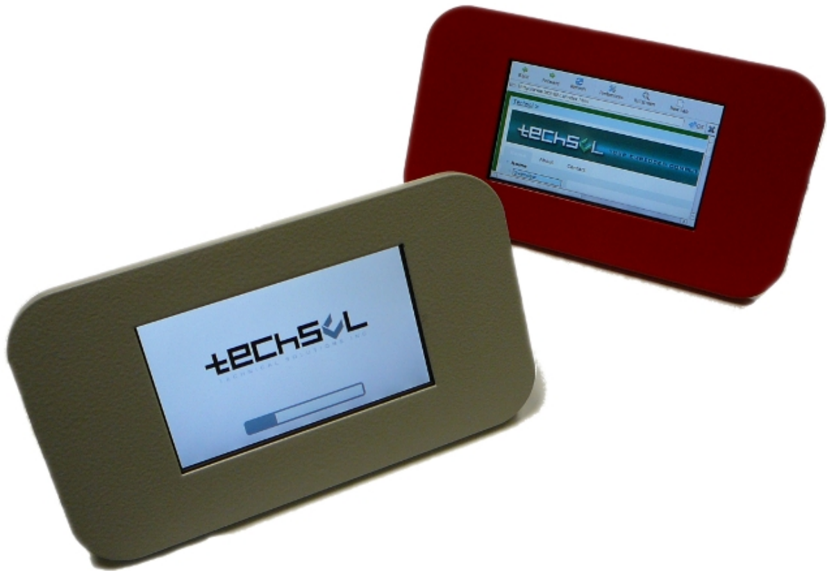
2009-12-03 - Techsol's TPC-43C Medallion Touch-Panel Computer .