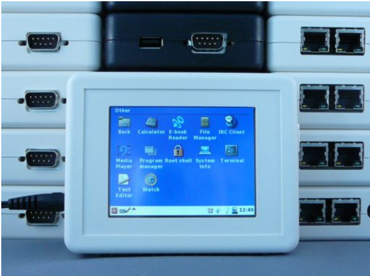
2009-01-27 - Techsol's TPC-35B Medallion Touch-Panel Computer .