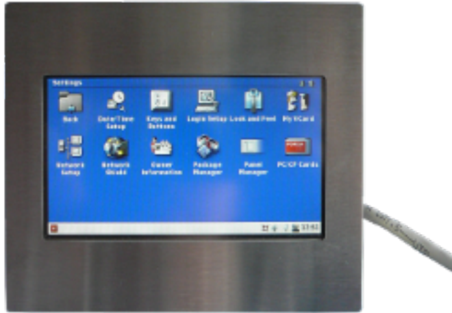
2009-07-08 - Techsol's TPC-43B Medallion Touch-Panel Computer .