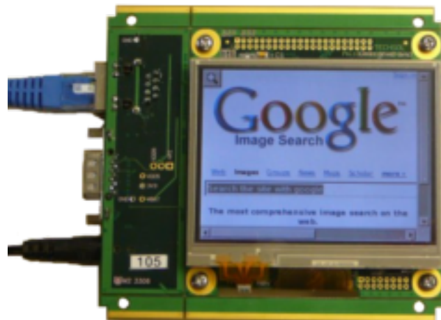
2007-09-26 - Techsol's TPC-35A Medallion Touch-Panel Computer .