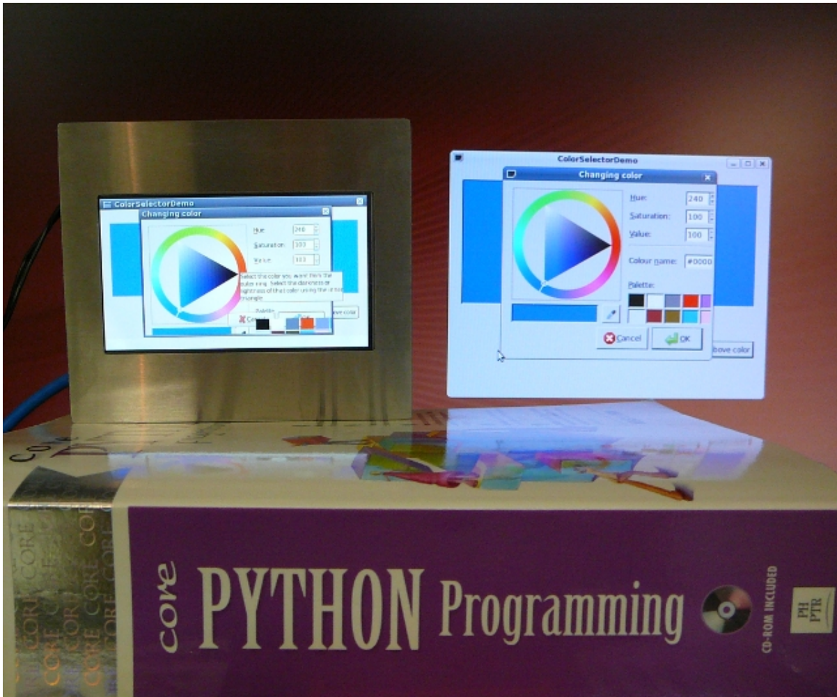
2009-11-03 - Medallion Touch Screen Computers available with Python-GTK support.